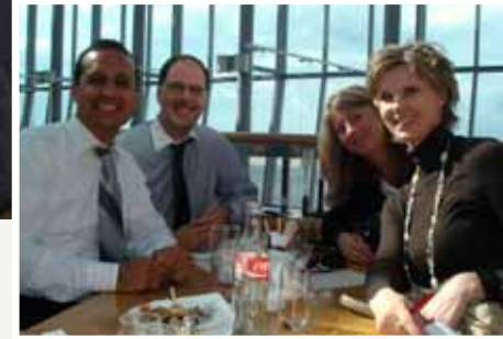
Nordic AmCham Directors at the 2008 OSAC Nordic Summit in Stockholm.