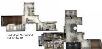
Gold's Gym Akersgata 51 NYE LOKALER

Vær tidlig ute. Ta kontakt for å få ukens tilbud... salg@goldsgym.no eller sms: Send gold til 2401